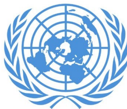
United Nations Support Mission in Libya بعثة الأمم المتحدة للدعم في ليبيا

In agreement with the delegates of the House of Representatives and the High Council of State on one hand and the representative of the Presidential Council on the other, UNSMIL will resume facilitating talks on resolving the crisis of the Central Bank of Libya at its headquarters in Tripoli on Wednesday (11 September).