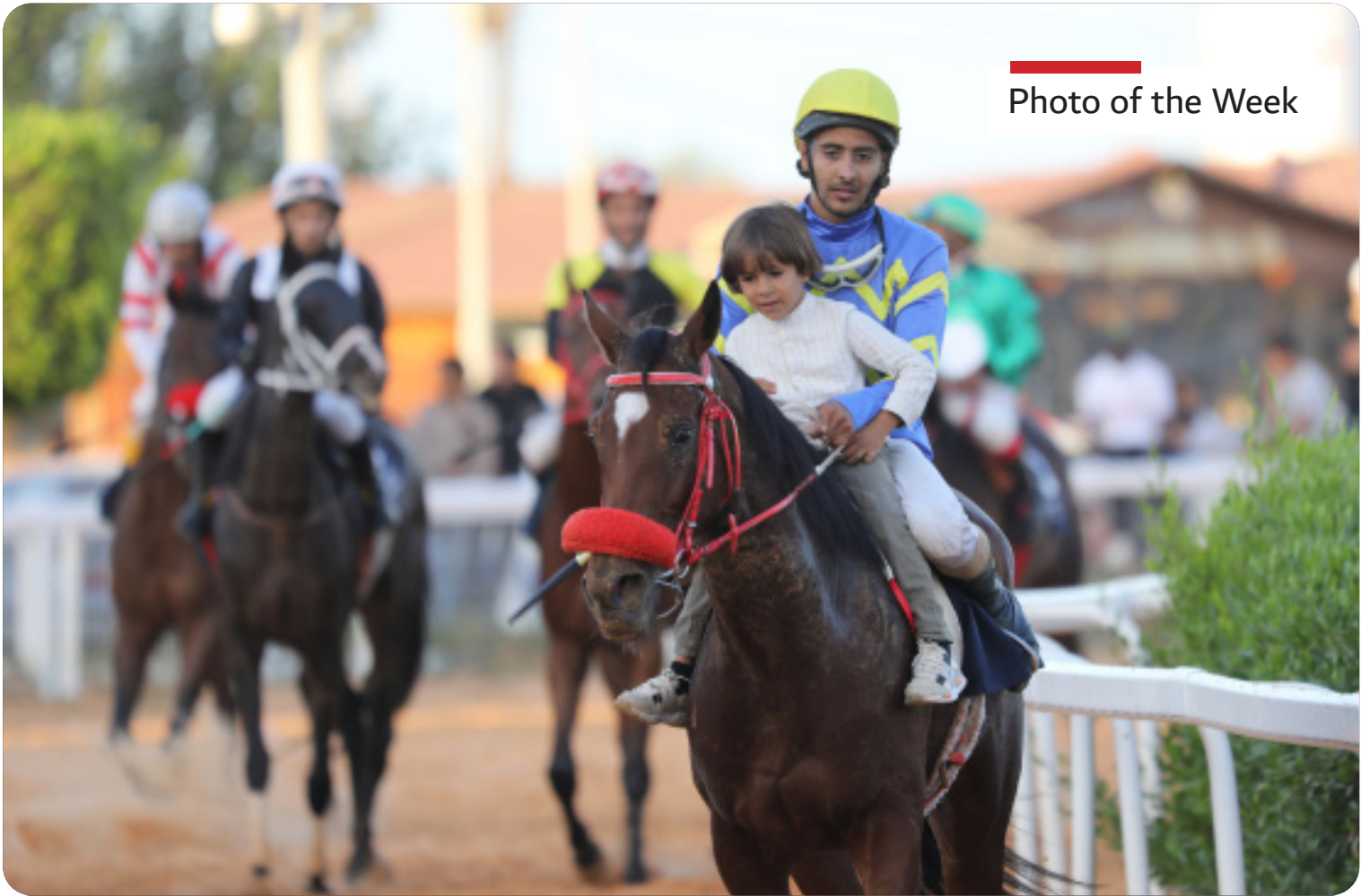
Photo of the Week