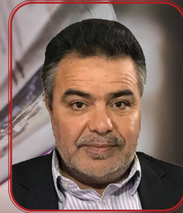
By Abdullah Alkabar a Libyan political writer and commentator

As the anniversary of the February Revolution approaches, repeated calls discouraging people from celebrating it emerge, citing the current reality created by the revolution. They argue that the country enjoyed security and safety in the past, referencing the “ten loaves of bread for a quarter of a dinar” during the former regime. However, such calls were largely ignored as most cities were adorned with independence flags and portraits of martyrs. People of all ages took to the streets to celebrate, dismissing the discouraging calls mostly made by groups not in favor of the revolution that disrupted their peace and contentment or because they were not honored to support and participate in it, or are remnants of the former regime’s supporters.