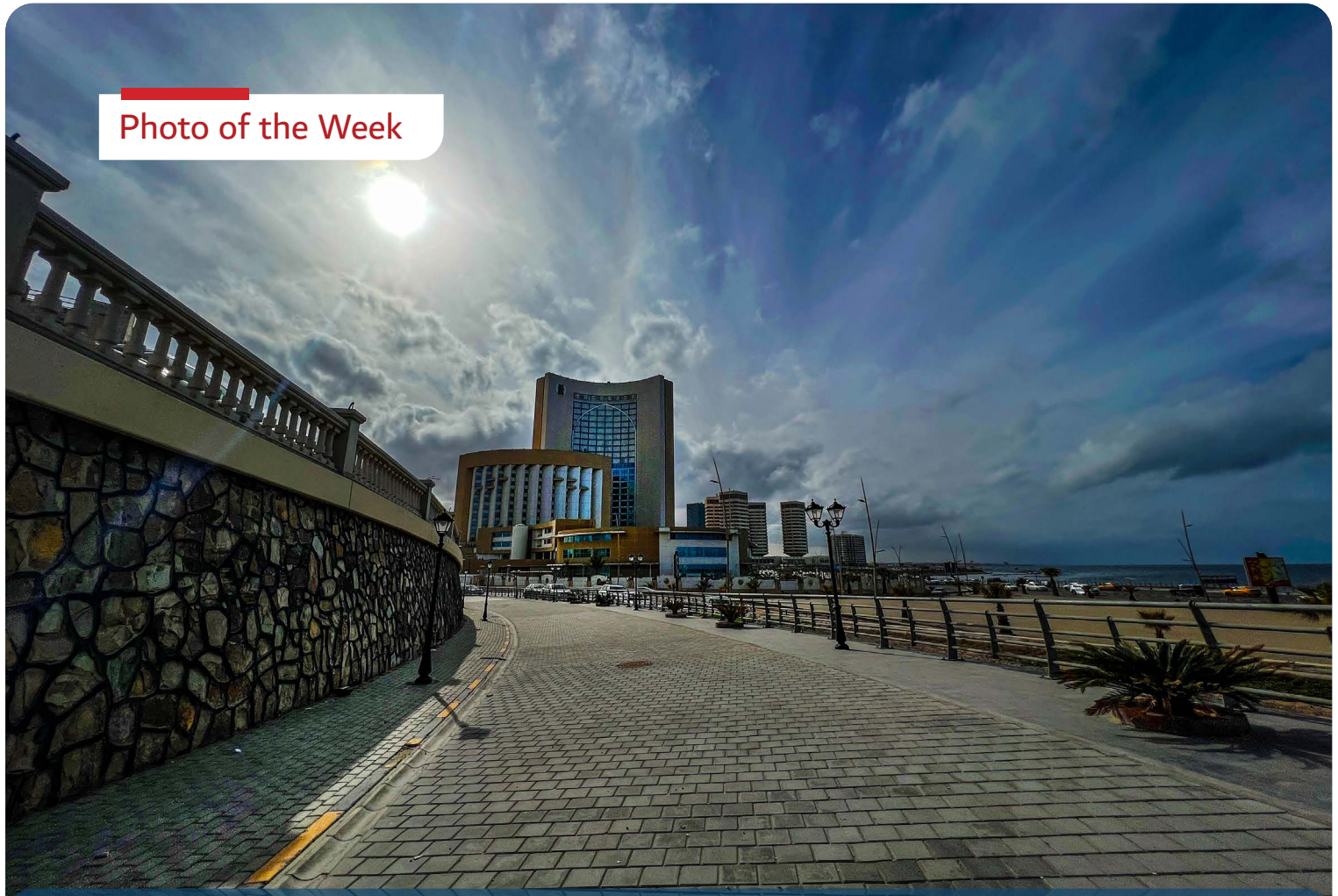
Photo of the Week