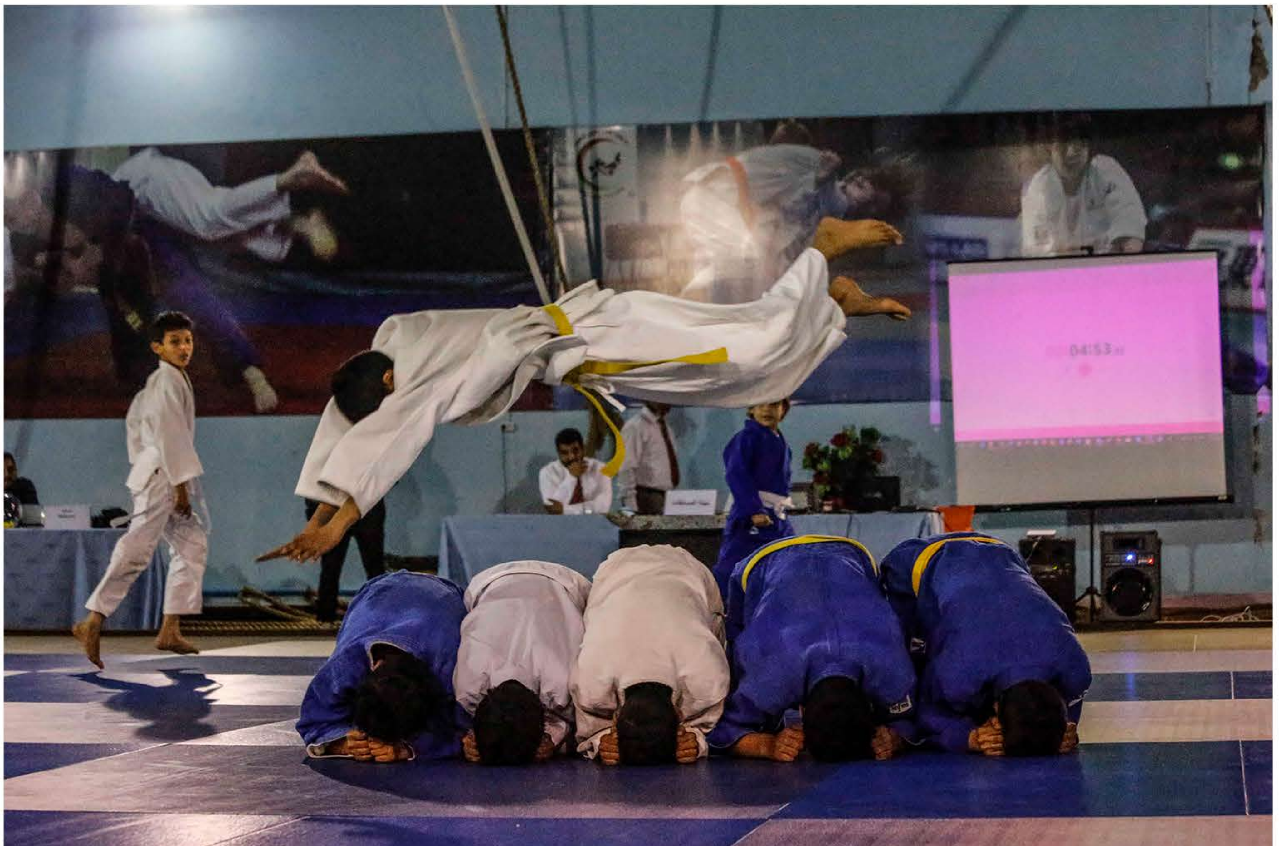
Photo of the Week: A young judoka performs a dive roll during Libya Judo Championship, Tripoli